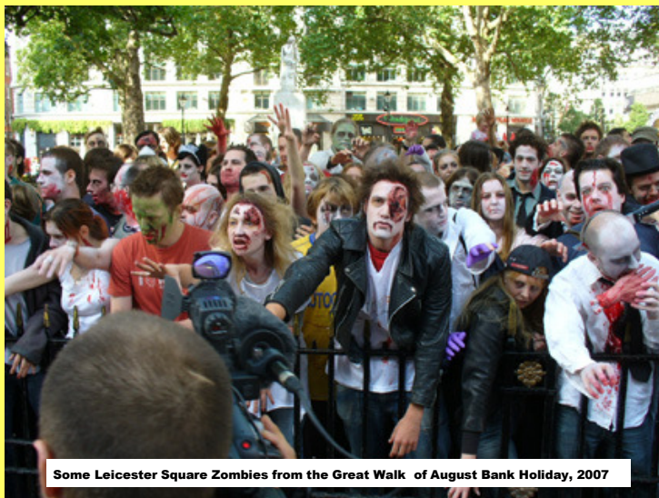
Some Leicester Square Zombies from the Great Walk of August Bank Holiday, 2007

Regarding fitness levels, remember the slower the