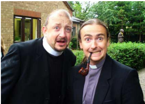
When the dead started walking, the religious few started running, even though they were supposed to be at the centre of the defence.