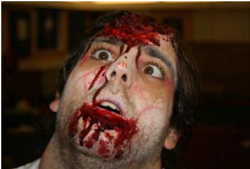
Even distinguished members of the scientific community succumbed to the infection last year, despite their promises...

When our thoughts focus on what we are going to do this summer, could it be paddling at the coast or heading abroad for sun, sea and sangria or possibly wading knee deep in entrails and the flesh of the Living Dead at Zom-bie Fest 2008 .